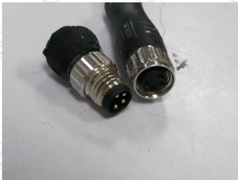
Fig.6- Sample after IP6X test