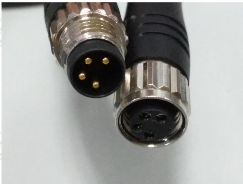
Fig.7- Sample after IPX7 test