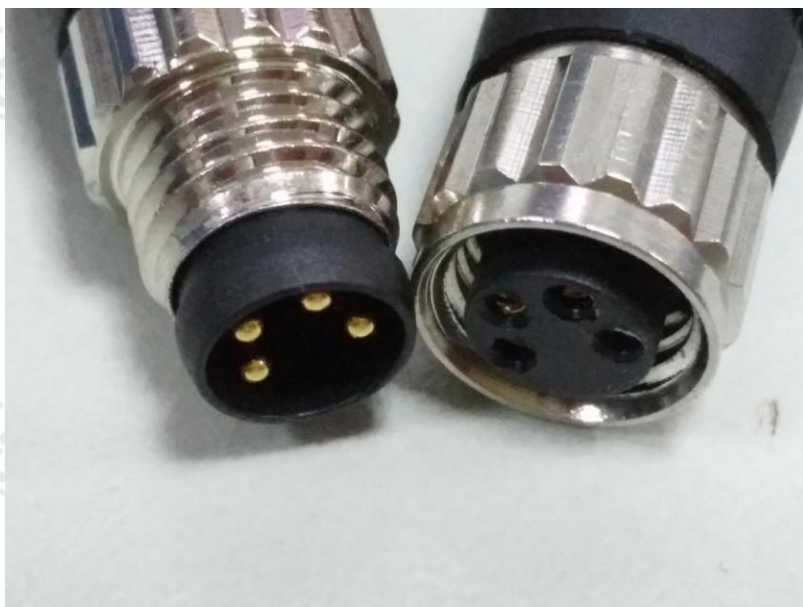
Fig.2- Overall view of model MB04C3LSG3AB