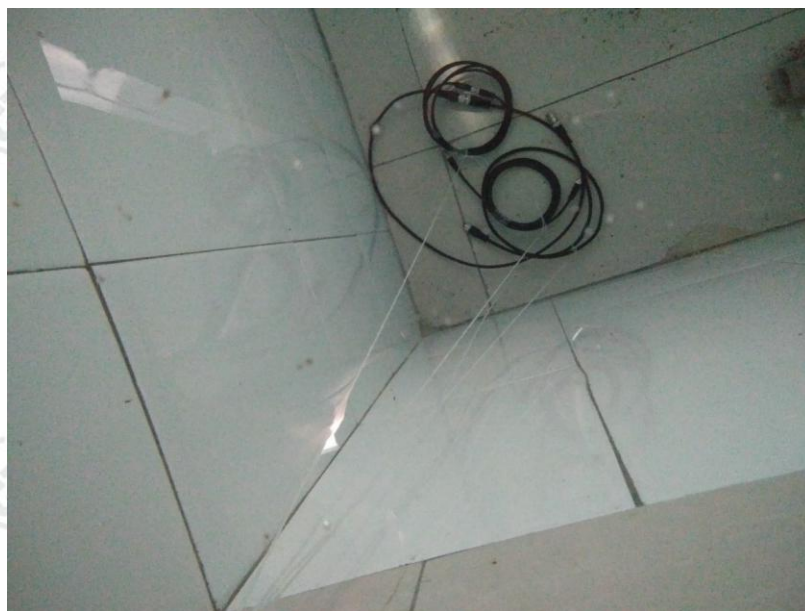
Fig.5- Sample during IPX7 test