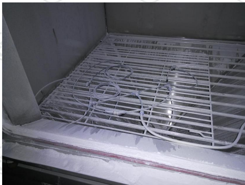
Fig.4- Sample during IP6X test