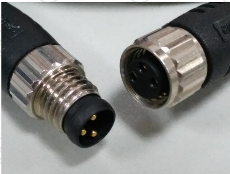
Fig.8- Overall view of model MB03CXXXX series