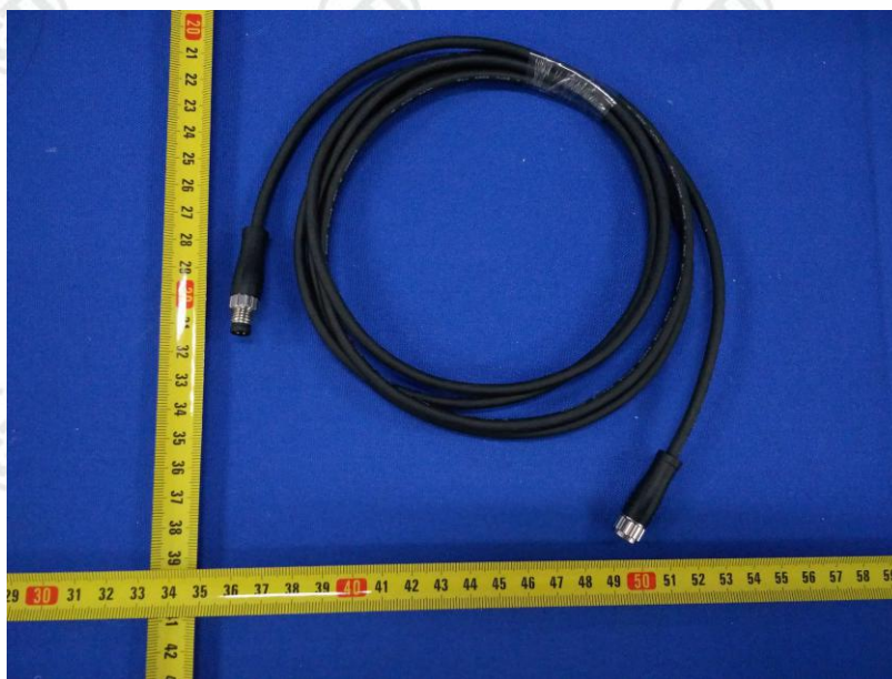
Fig.1- Overall view of model MB04C3LSG3AB