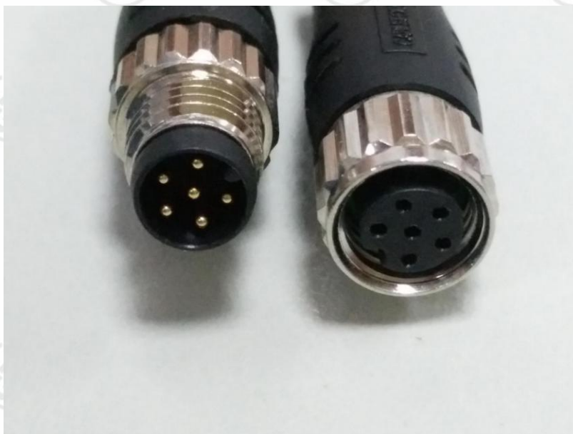
Fig.10- Overall view of model MB06CXXXX series