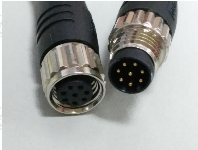
Fig.11- Overall view of model MB08CXXXX series