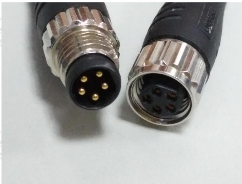
Fig.9- Overall view of model MB05CXXXX series