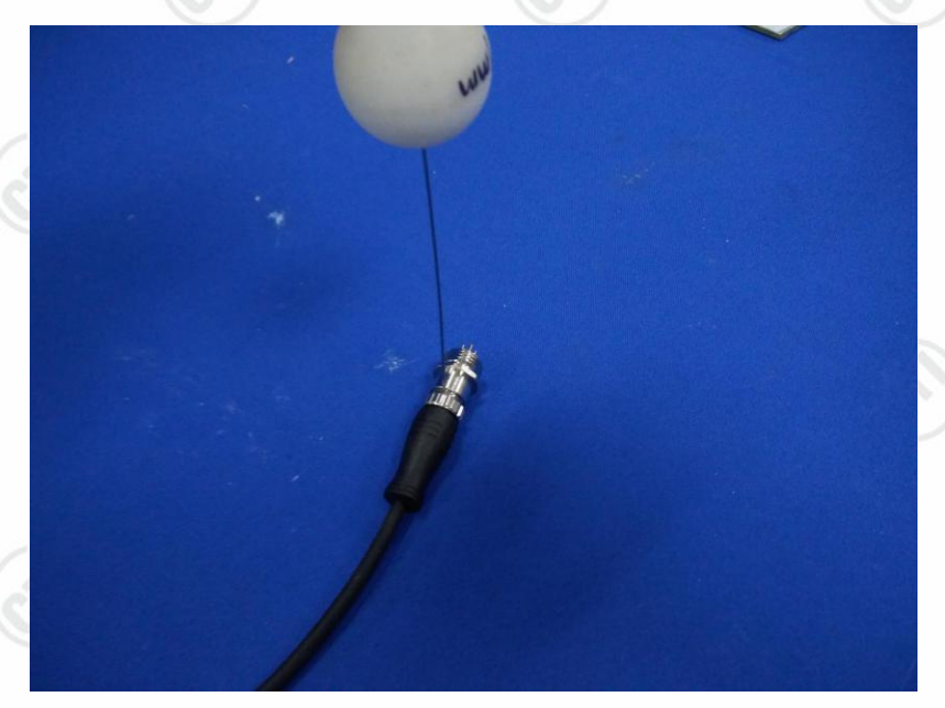
Fig.4- Sample during IP6X test(using test wire of 1.0 \text{mm} \Phi )