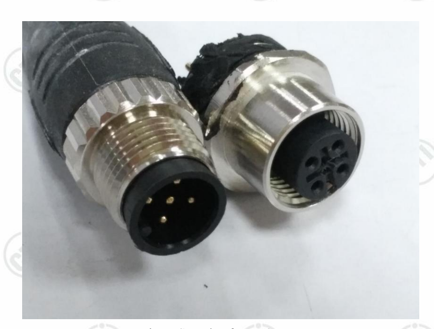
Fig.7- Sample after IP6X test