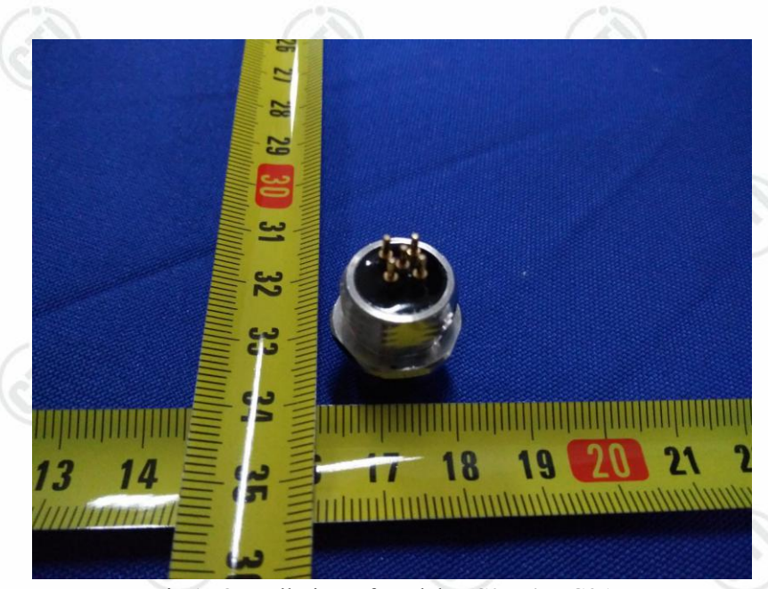
Fig.1- Overall view of model MC05P4LPG3AB