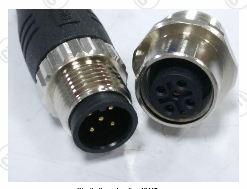
Fig.8- Sample after IPX7 test