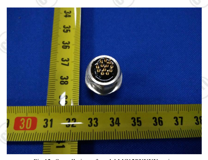
Fig.12- Overall view of model MC12PXXXX series