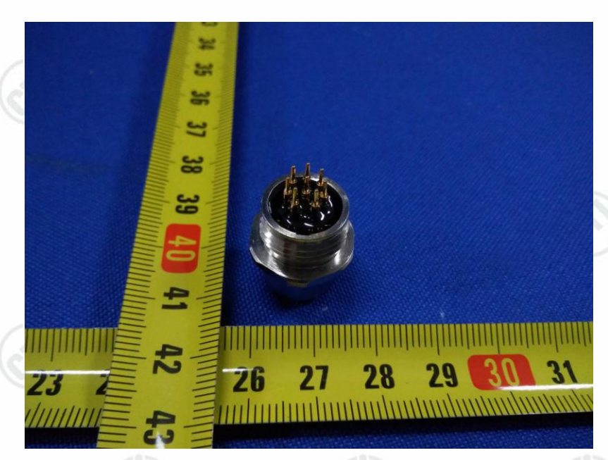
Fig.11- Overall view of model MC08PXXXX series

Report No.: EED31I00484801R1 Page 9 of 9