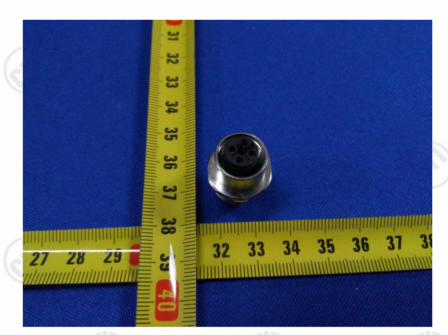
Fig.3- Overall view of model MC05P4LPG3AB