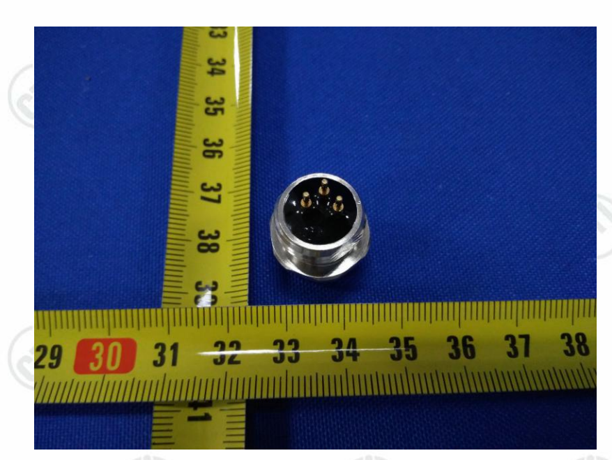
Fig.9- Overall view of model MC03PXXXX series