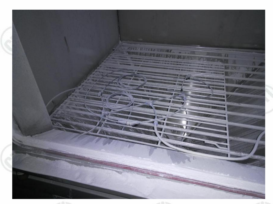
Fig.5- Sample during IP6X test