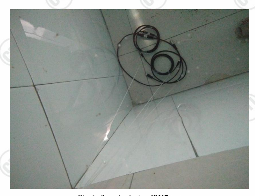
Fig.6- Sample during IPX7 test